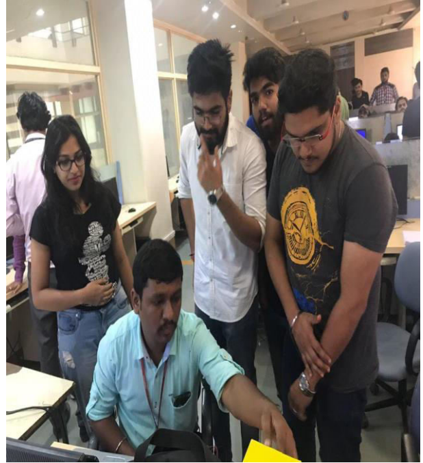
Expert Giving demonstration to the students.